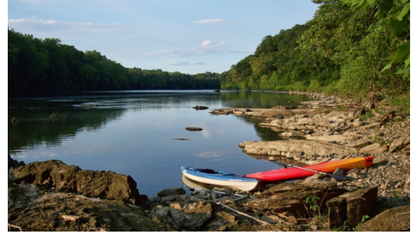
Kayaks in Antietam Creek

Our region is known for having its rich Civil War history, National Parks, breathtaking views of the Allegheny Mountains, Potomac River and creeks, and our Hiking/Biking trails. Amongst the hallowed grounds and beauty, visitors will find recreational adventure, award-winning arts & entertainment, shopping, palate pleasing dining options, & lots of annual events to enjoy!