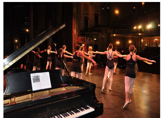
The Maryland Theatre